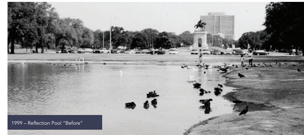
1999 – Reflection Pool “Before”

The Jones Reflection Pool was dedicated in 2003 and has been one of the favorite spots in Hermann Park ever since. With the next master plan currently under way, the Conservancy is hard at work creating plenty more favorite spots for the next generation of Park visitors.