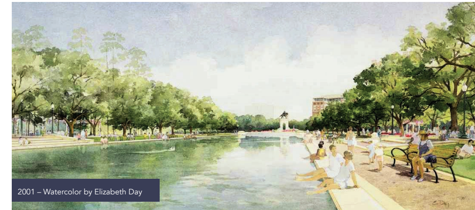
2001 – Watercolor by Elizabeth Day